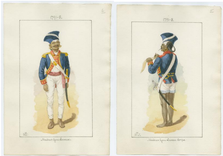
Figure 1: Madras Gun Lascars 1791-1798 7

and they were provided on an as required basis. By 1831 the number of gun lascars provided for each artillery company had been standardised and they were being used in all campaigns undertaken by the Presidency armies. Similar practice was also followed in the other Presidency Armies. 6