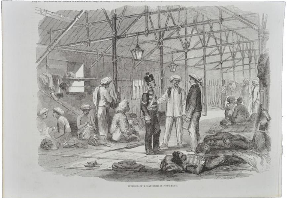
Figure 2: Mat Sheds in Hong Kong. 24

The good health enjoyed by the lascars did not last long and the initial stay at Hong Kong was especially hard on them. While the European soldiers were permitted to remain on board in the relatively healthier environs of their transport ships, the Indian sepoy and lascars were compelled to stay ashore in mat-sheds made of bamboo, tied together with rattan, with not a nail being used in their construction. They were rather long, with the arms kept down the middle while the lascars slept on either side. The personal belongings were also kept along the sidewalls. As the makeshift sheds exposed the lascars to the rigours of both the hot sun and the torrential rains, the sickness and mortality rate of the Gun Lascars increased. 25